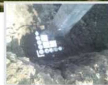
Pyramid installation in foundation