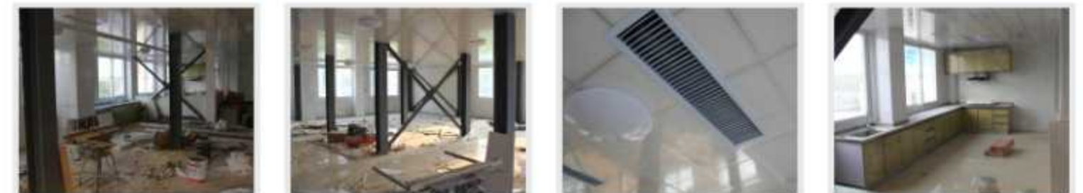
The ground floor of the 5 stories dormitory is a dining room, this is installation process, air-conditioner and kitchen room picture