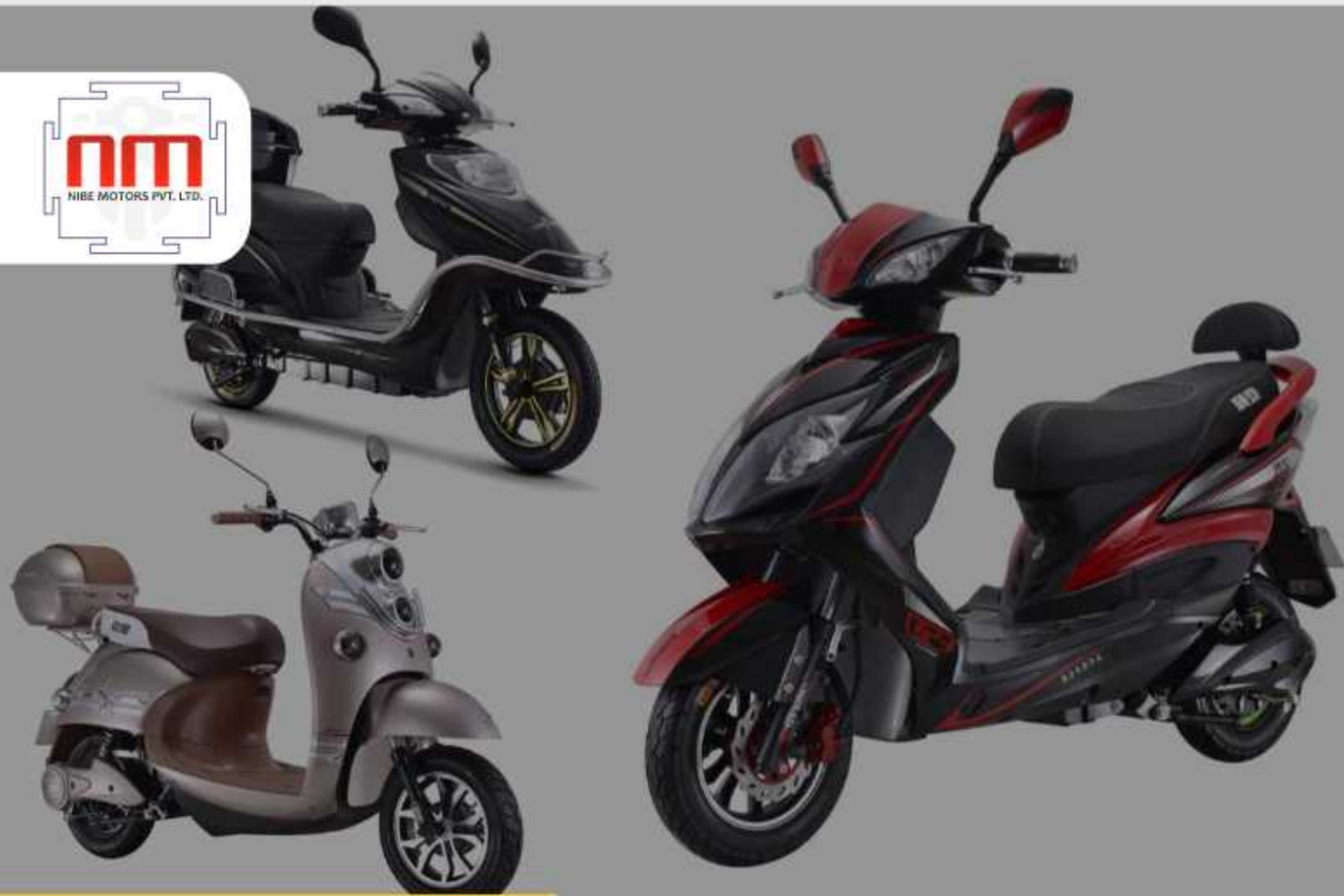
Nibe Motors Pvt. Ltd.

Nibe Motors Private Limited is a professional electric vehicle company. It consists of R&D Dept. and Manufacturing Dept. The company is located in India. The plant spreads in an area of 12000 square meters situated near the Metro high way of the city. We study designs and manufacture fashionable electric vehicles. Our company is equipped with perfect hardware facilities, software and environmental conditions. Our facilities include advanced test department and a manufacturing line.