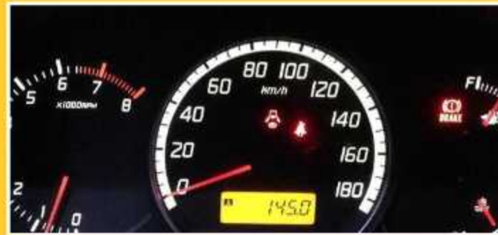
High Temperature Test