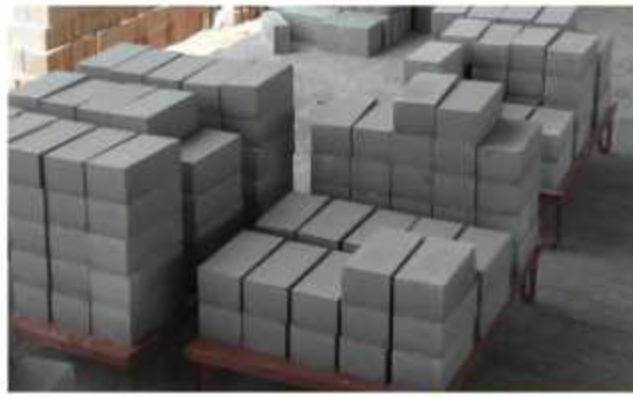
Aerated Concrete Blocks Manufacturing

Manufacturing Capacity – 4000 Tonn/Month