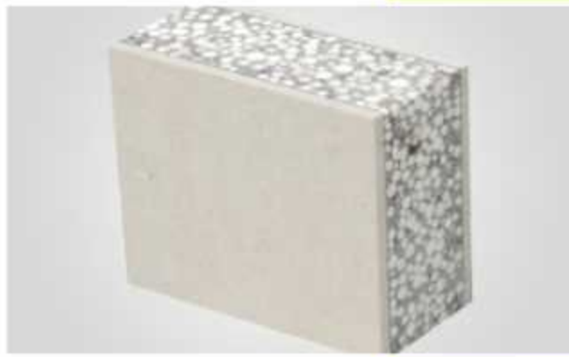
Aerated Concrete Panel Manufacturing

Manufacturing Capacity – 4000 Tonn/Month