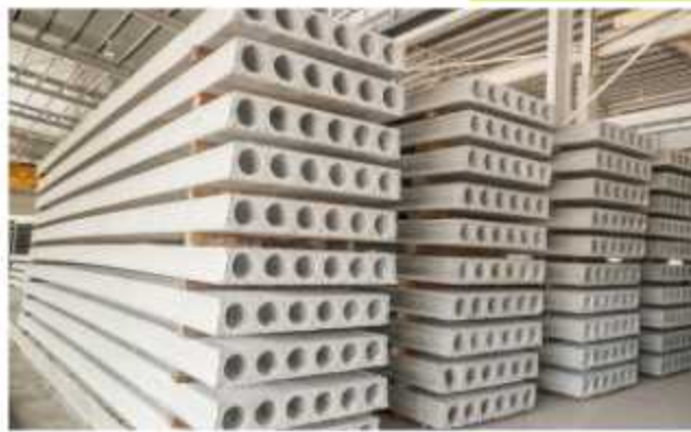
Fly-Ash to Hollow Slab Manufacturing

Manufacturing Capacity – 1500 Tonn/Month