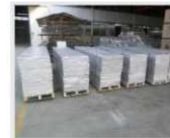
Pre-fabricated concrete Panels