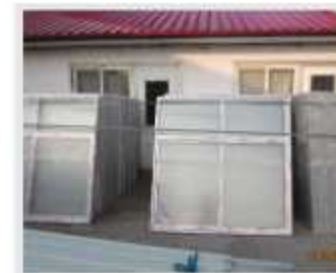
Aluminum alloy Plastic Steel Windows