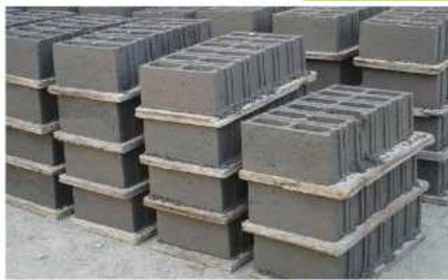
Fly-Ash to Construction Sand Manufacturing

Manufacturing Capacity – 2500 Tonn/Month