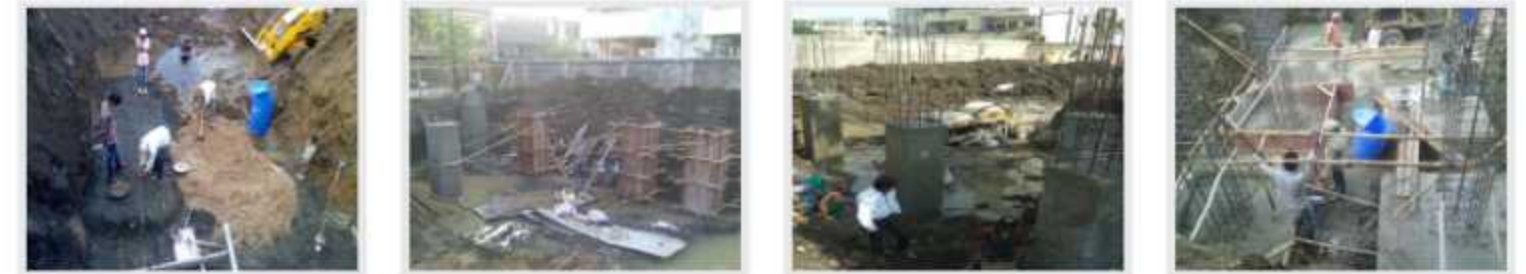
Foundation and anchor bolts installation